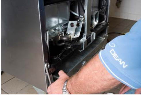
Figure 4 Pry on the loosened manifold as necessary to install the inward pointing elbow.