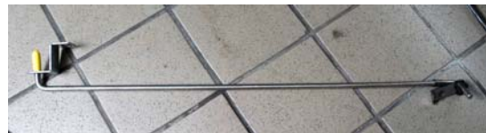
Figure 7 The oil-return activation rod is shown with its hardware attached.