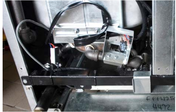
Figure 5 The rear valve switch is shown in place. It is wired in parallel with the existing switch, using piggyback terminals.