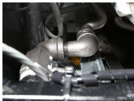
Figure 3: The valve and elbows in the kit are shown mounted on the oil-return manifold. Placement of the inward pointing elbow will probably require minor prying of the manifold assembly as shown in figure 4.