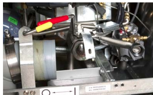
Figure 1: The original drain manifold extension has been removed. The flexible oil-return line is visible on the right.