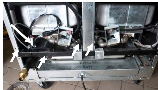
Figure 2: The square oil-return manifold is visible. The port on the left side (marked by down arrow) is removed and the bolts (marked by arrows) supporting the manifold are removed or loosened. The right side manifold bolts are loosened.